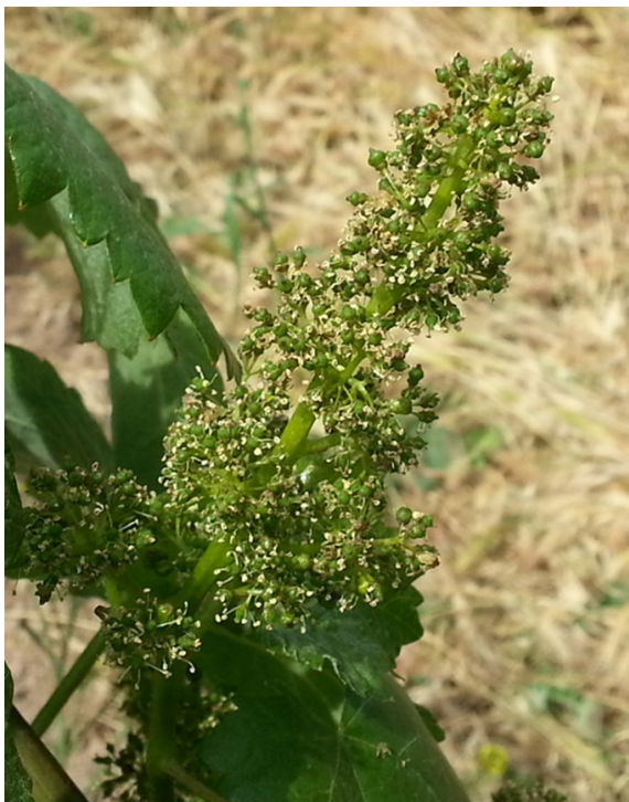
We have not noticed any issues during bloom. Fruit set and production appear.