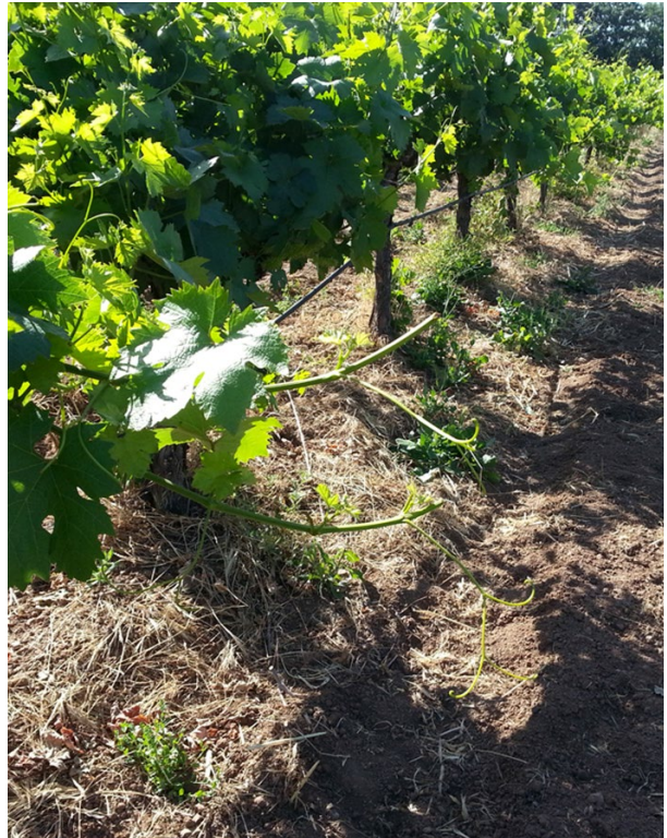
Occasionally, the deer will still cause minor damage.