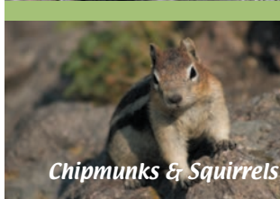
Chipmunks & Squirrels