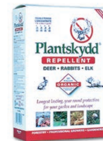
Soluble Powder Concentrates