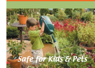
Safe for Kids & Pets